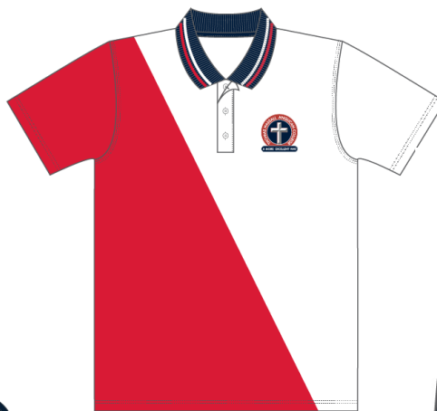
SPARE CHANGE OF CLOTHES