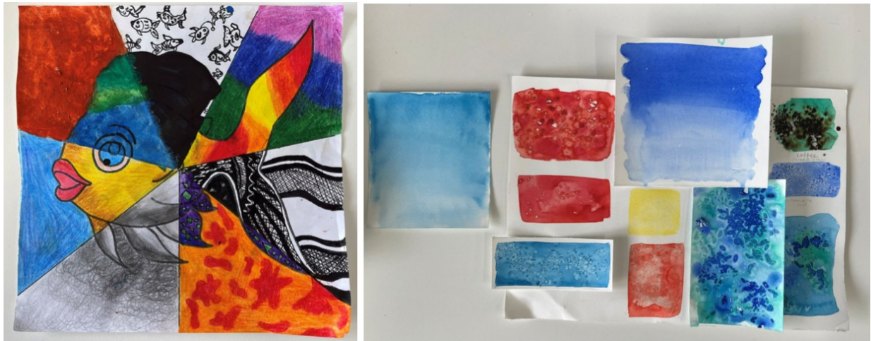
Jod K Elements of Art Fish Artwork

Experiments using rock salts, coffee, and rice as an effect on watercolour painting