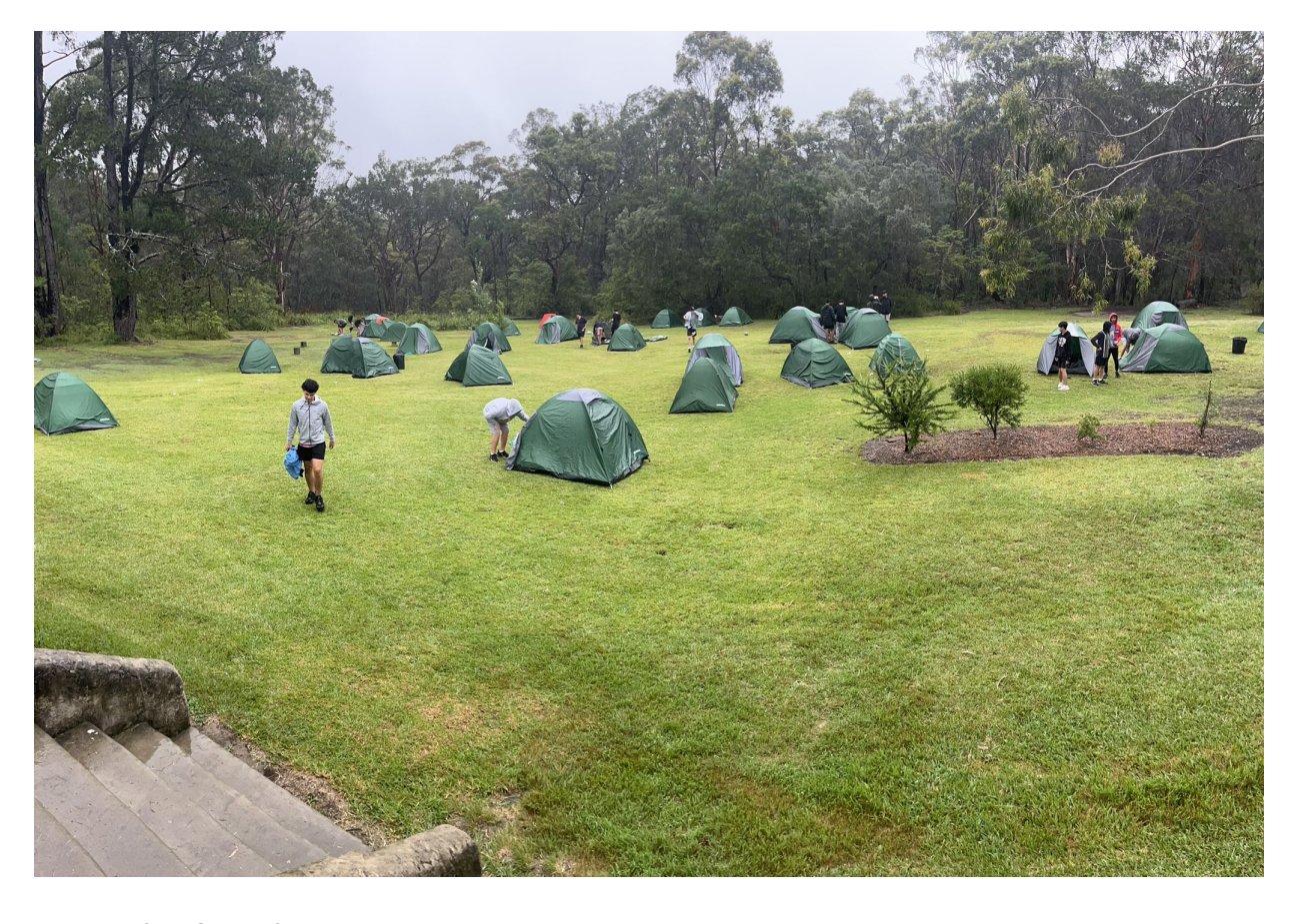
Recovering from the storm!