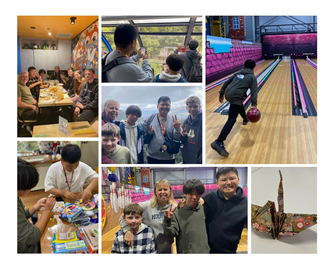
The Hobbins Family