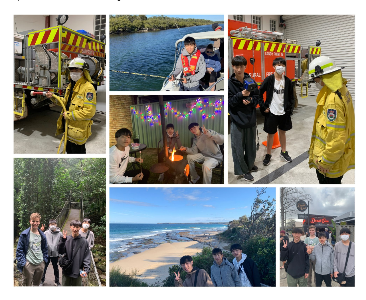
The Chipperfield Family

The experience of hosting three teenage boys with very minimal English was excellent! Google translate allowed instruction and explanation to bridge the language gap. The boys were extremely polite and grateful for our hospitality. I believe they will always look back on their experience to Australia as a great one.