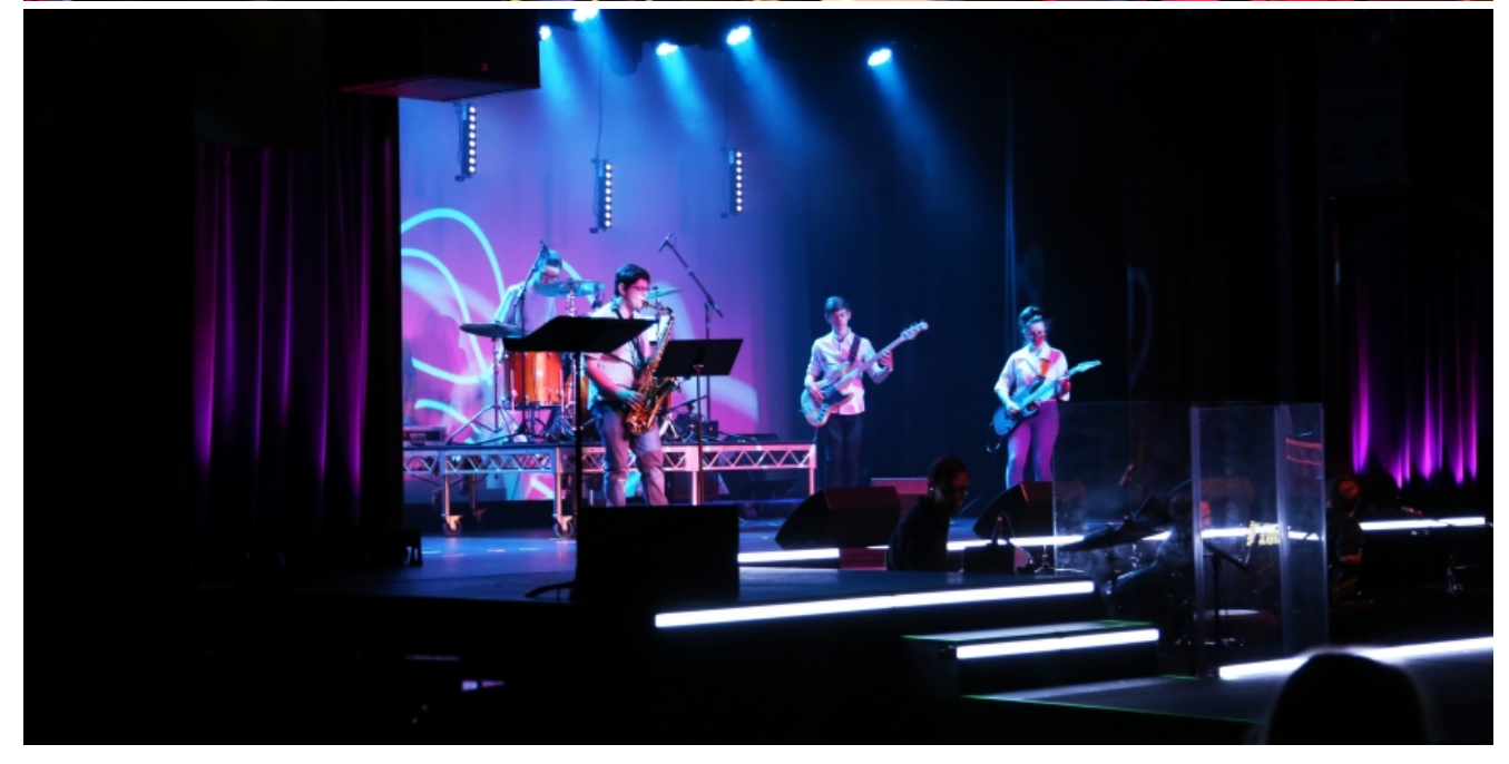
M.A.D.E. FOR STAGE