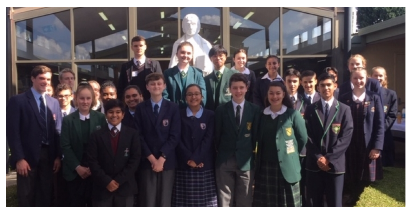
2019 MISA Year 9 Youth of the Year Contestants