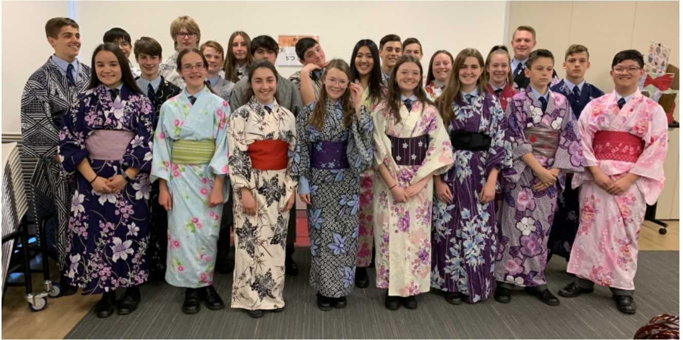
Year 10 Japanese