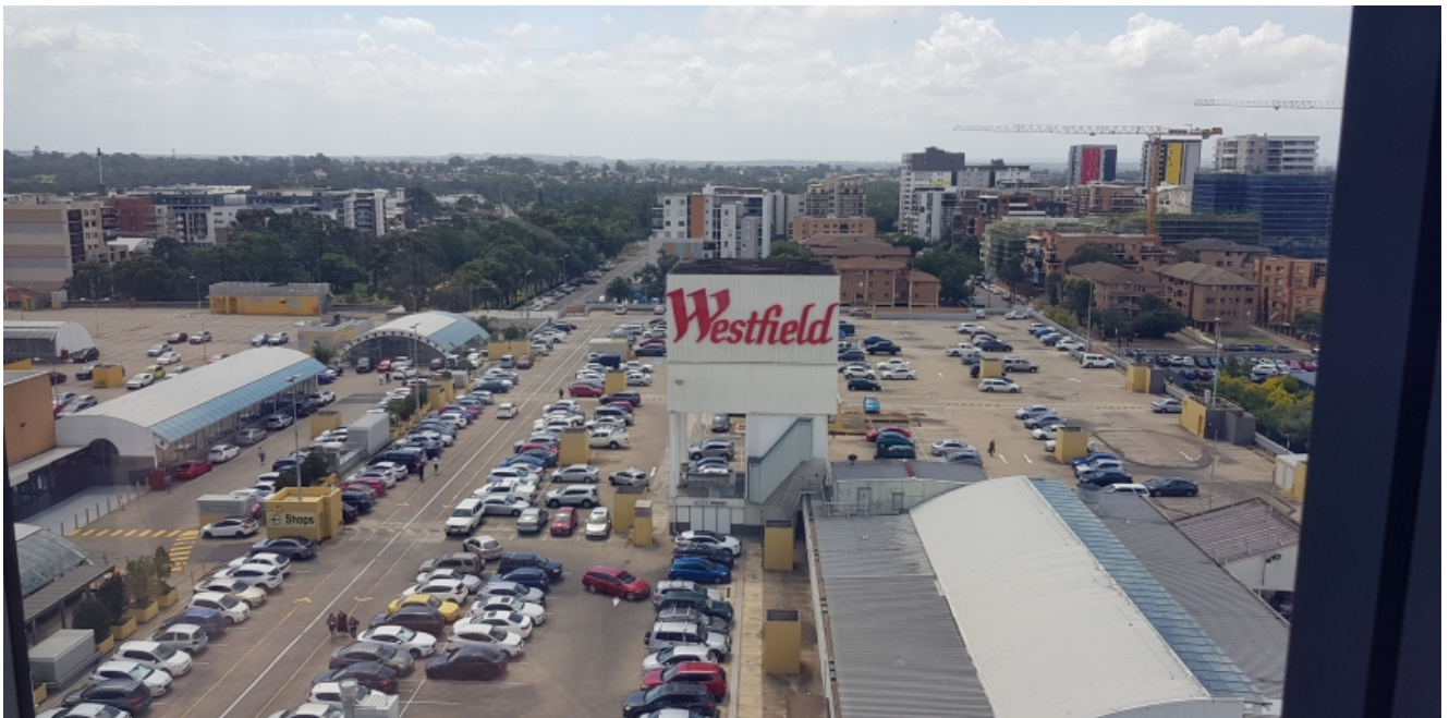
WSU Liverpool campus is right next to Westfields