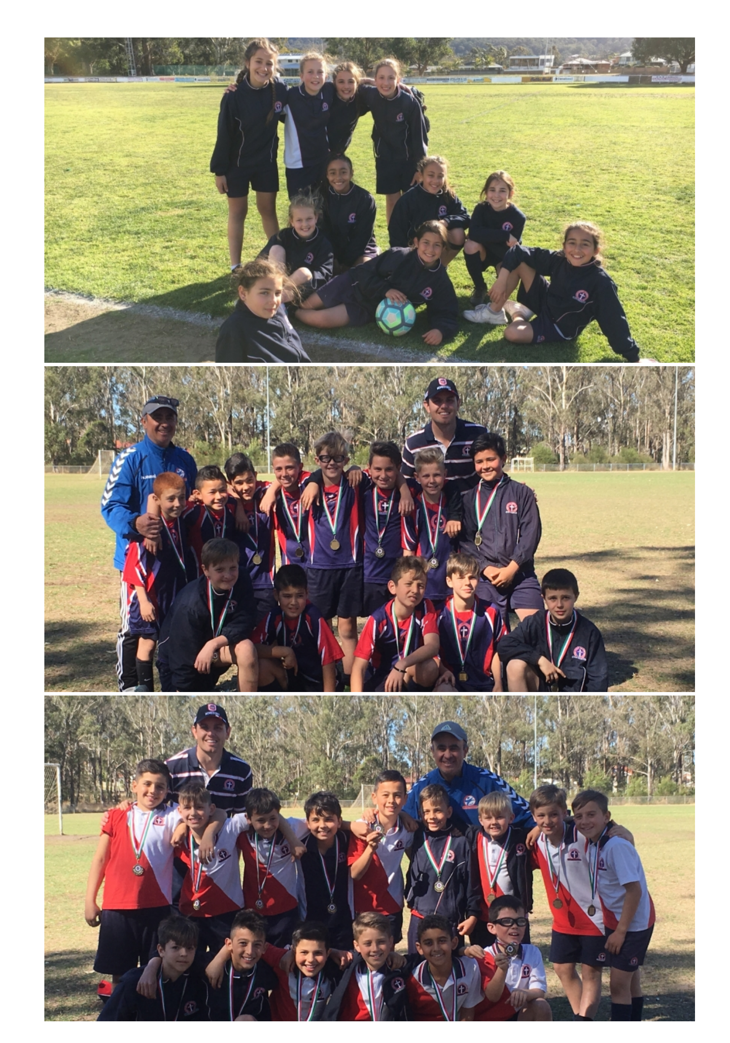
2018 FOOTBALL DEVELOPMENT PROGRAMS