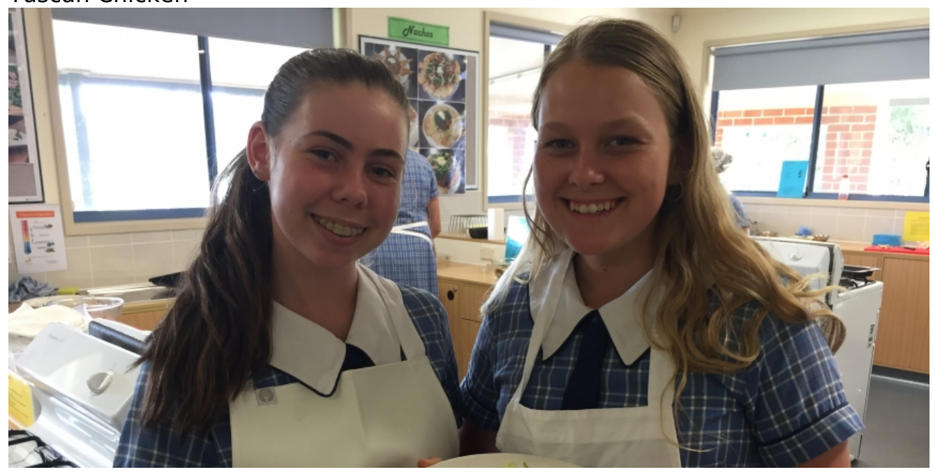
Yr 9 Food Technology