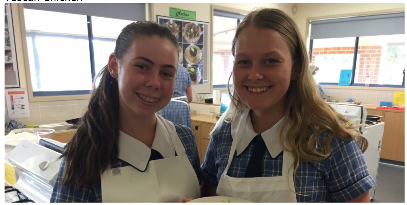
Yr 9 Food Technology