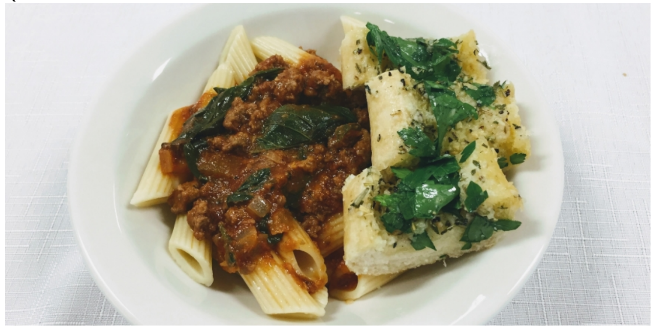
Tomato and Penne with Garlic Bread