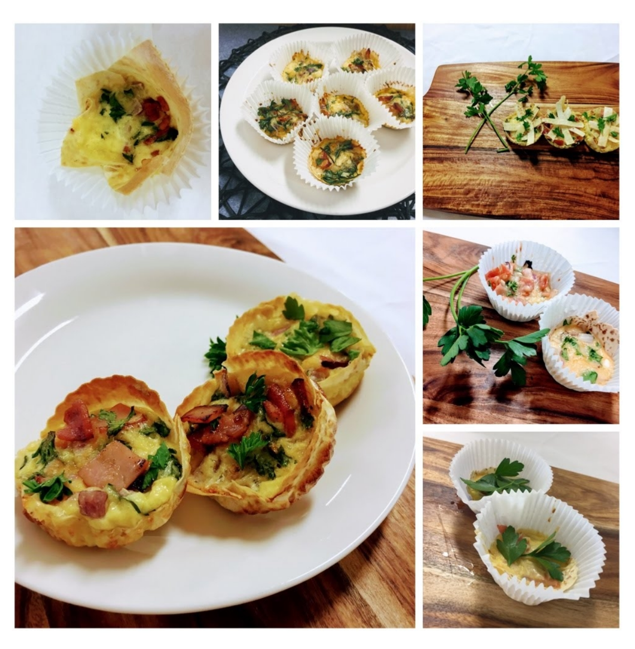
Year 9 Food Tech Quiches