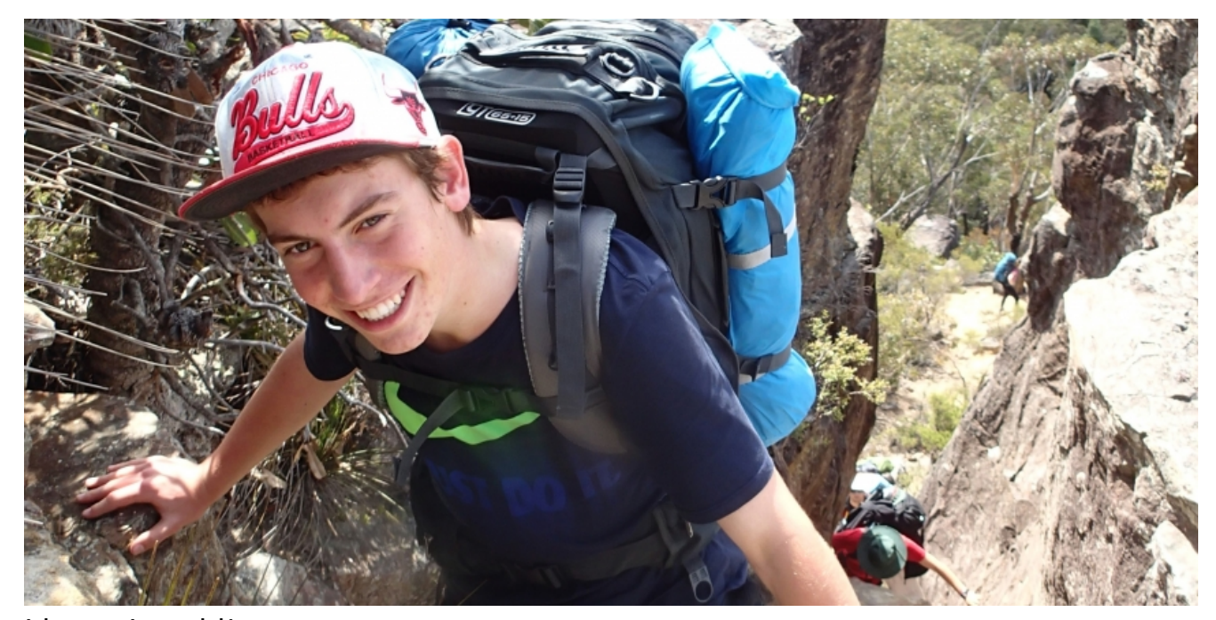
I knew I could!