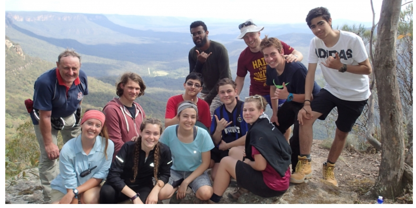
We made it together!