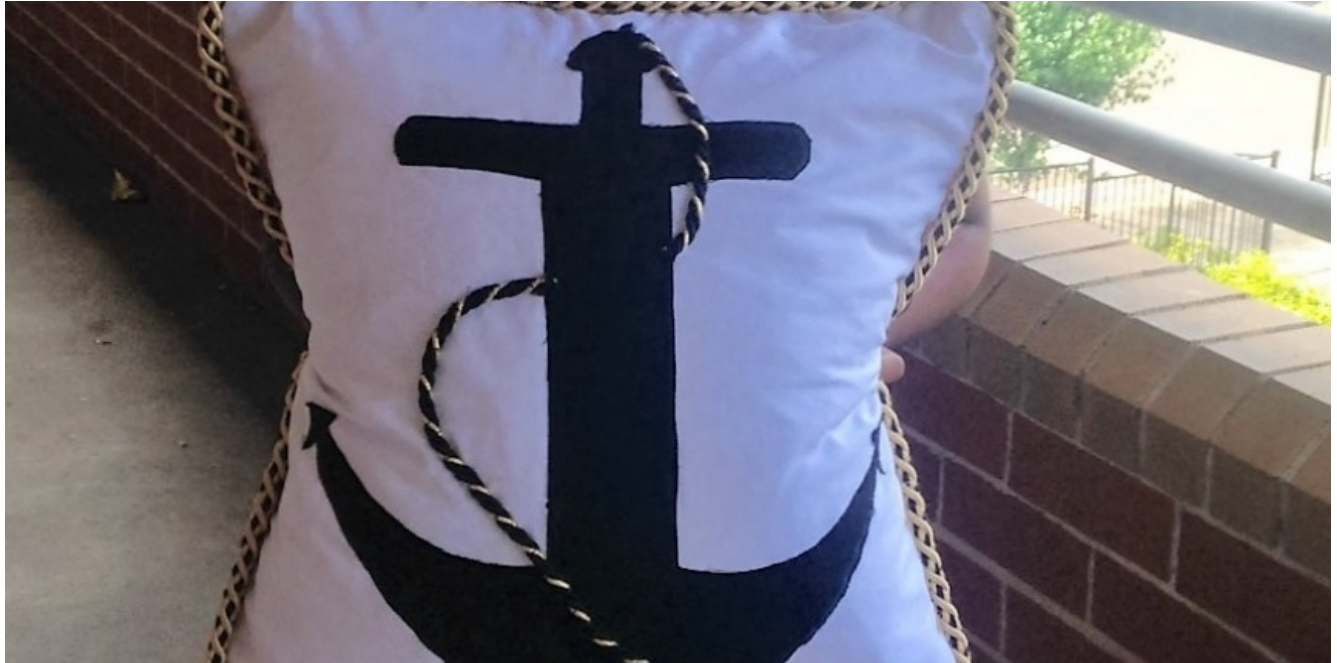
Nashita's Cushion Cover Design