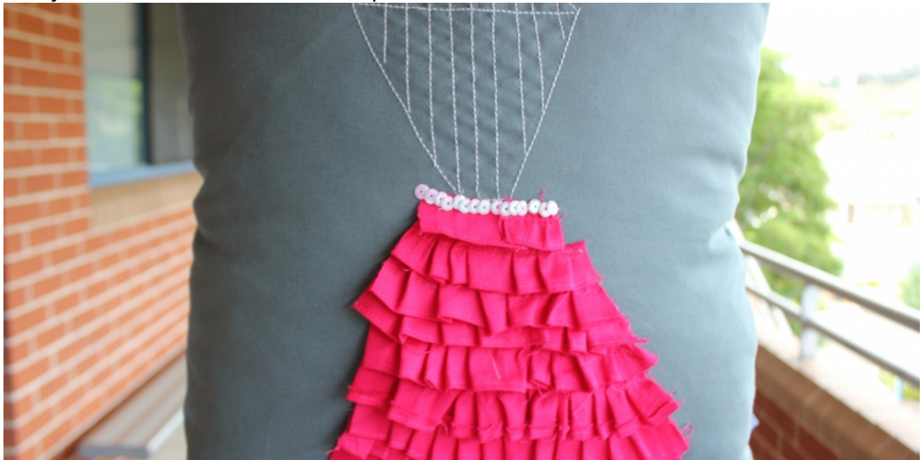
Yr 8 Cushions