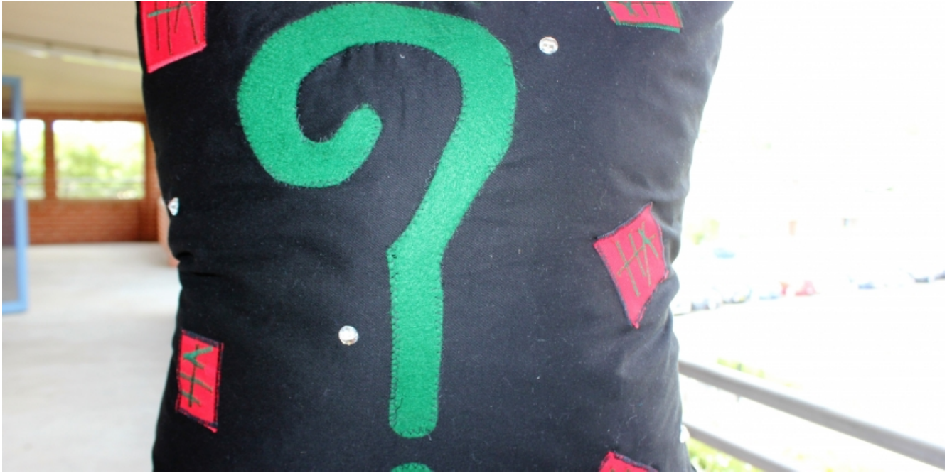
Yr 8 Cushions