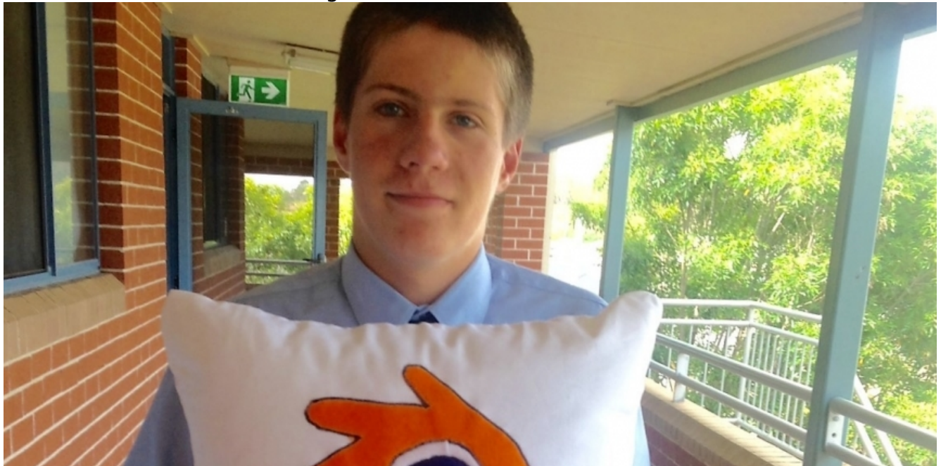
Stanton's Cushion Design from Year 8