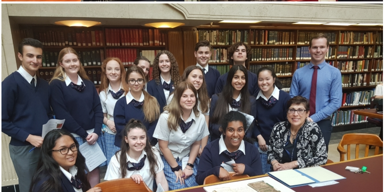
Year 12 History Extension Class with Thomas Hassall Diary