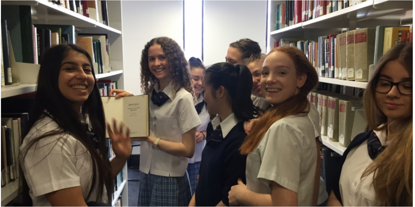
Fisher Library Finds