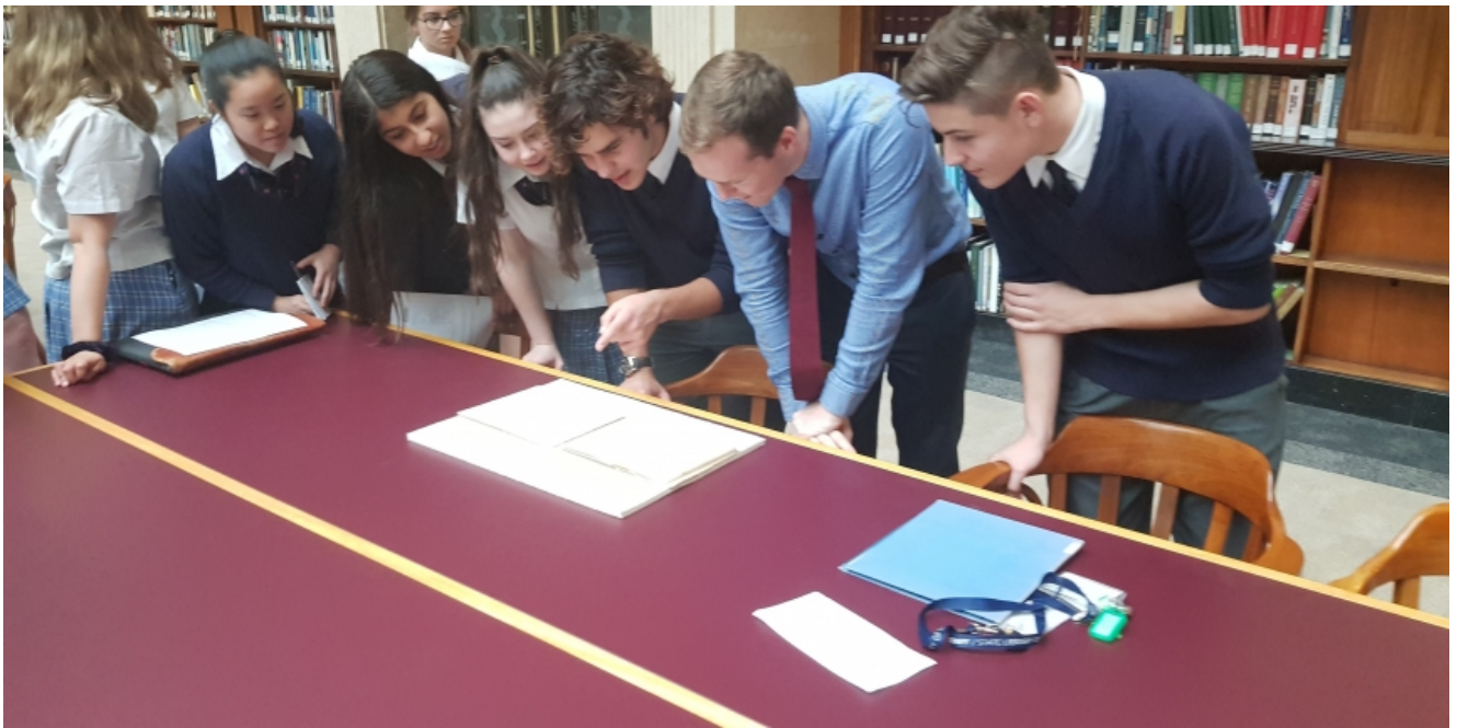
Learning from our name sake