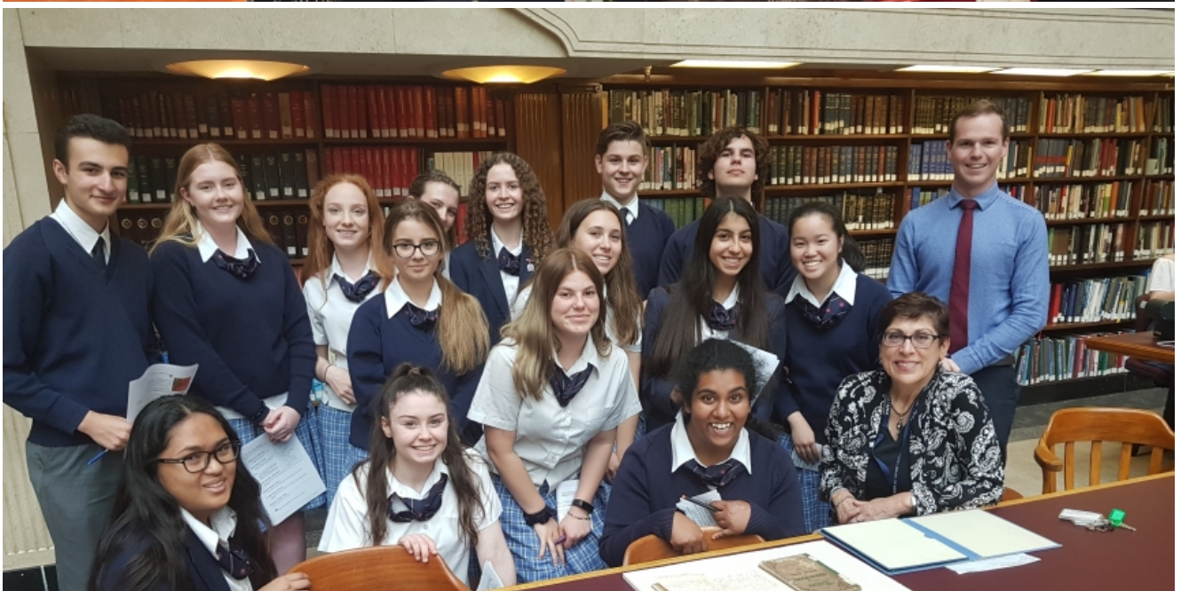
Year 12 History Extension Class with Thomas Hassall Diary