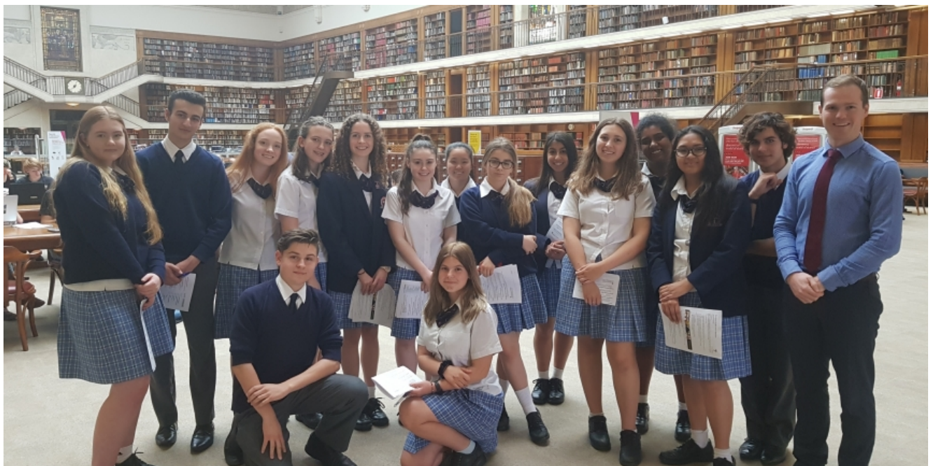
In the Mitchell Library