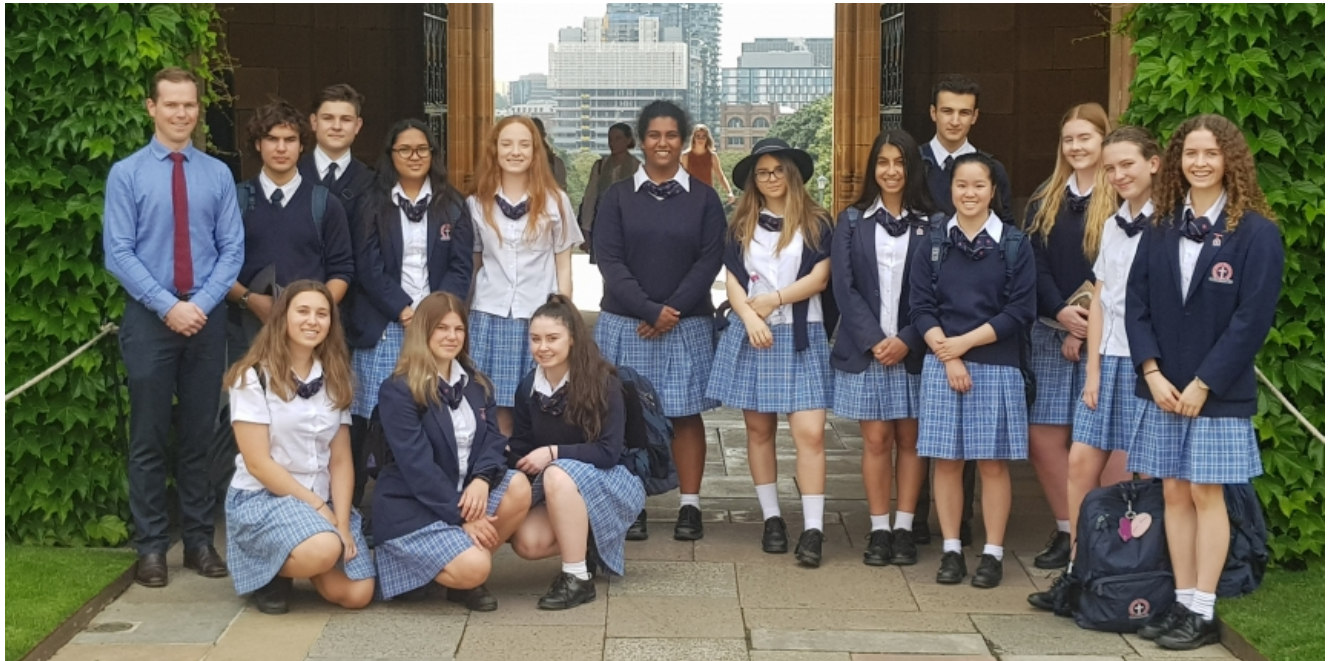
• Year 12 History Extension Class at University of Sydney