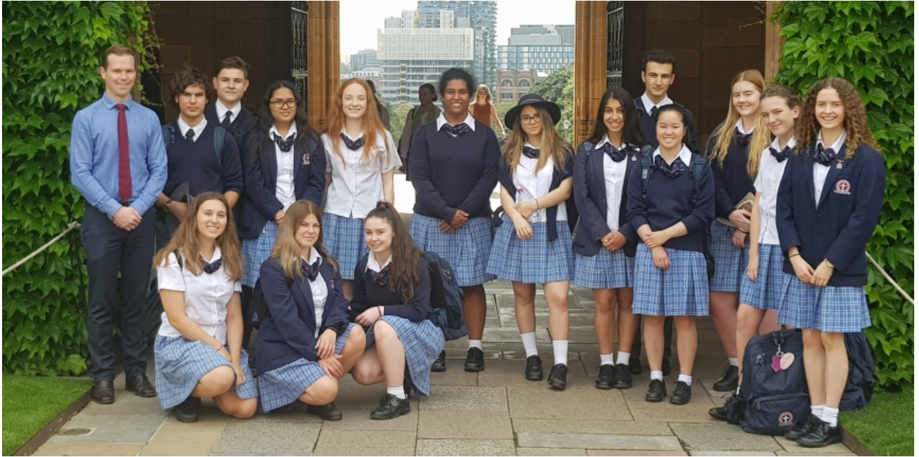
Year 12 History Extension Class at University of Sydney