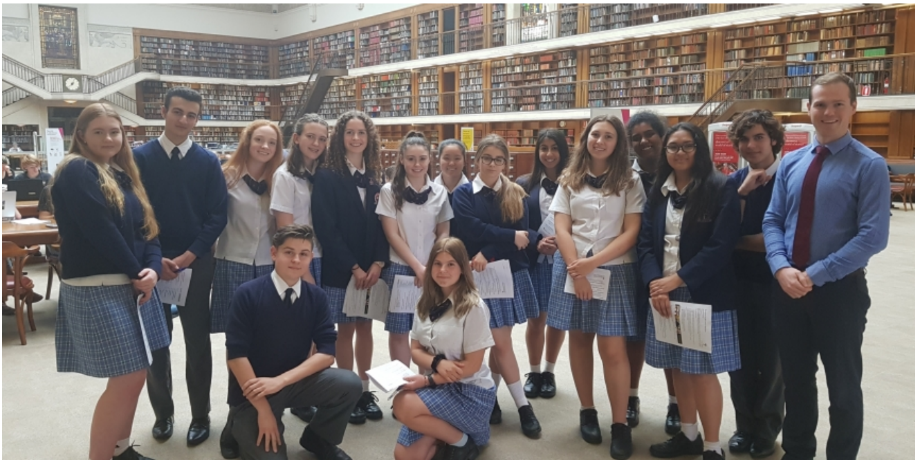
In the Mitchell Library