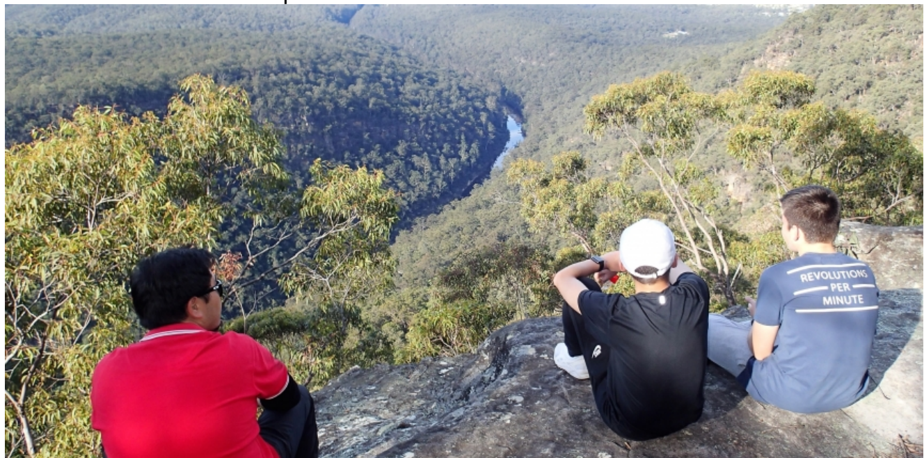
Reward for hard yakka up and down is often a superb view. Here - enjoying the Hawkesbury plains near Grose River.