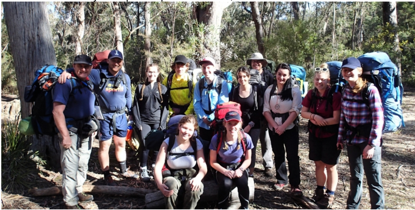
Silver Expedition to Wild Dog Mountains

Bronze Preliminary Camp Group at Deeimba, Yarramundi