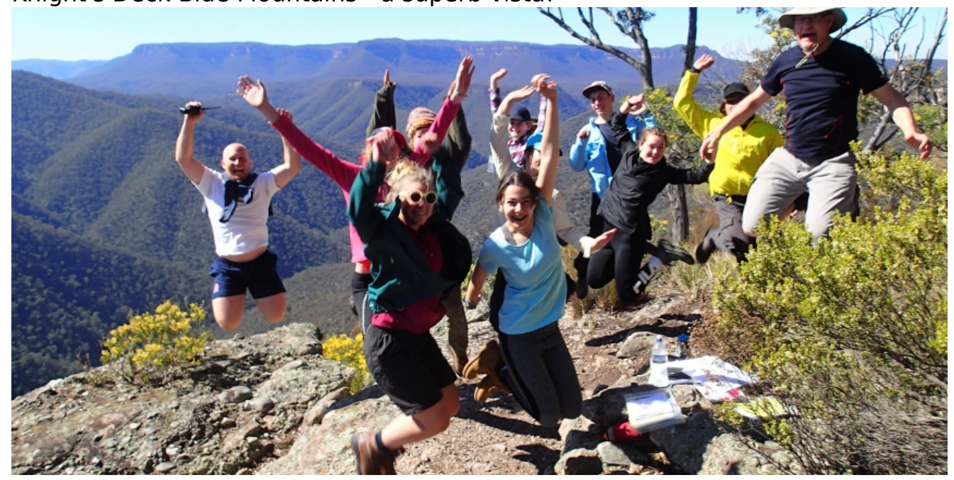
Oh What a Feeling - the beautiful outdoors!

Knight's Deck Blue Mountains - a superb vista!