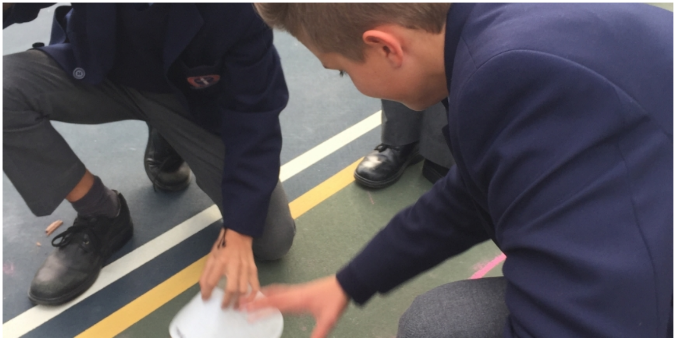
Year 7 Playing The Game4