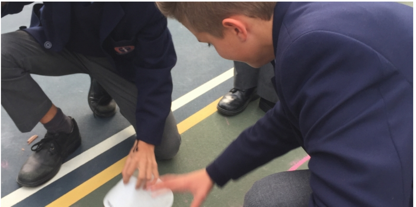
Year 7 Playing The Game4