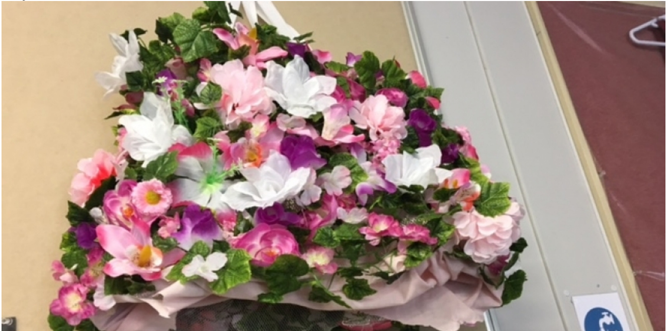
Allysan C & Brielle B